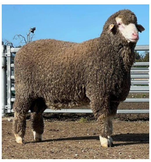
'Making sure there is a Genuine BALANCE in their stocks production and performance'